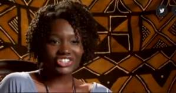
'Dark Girls' Documentary | Huffington Post