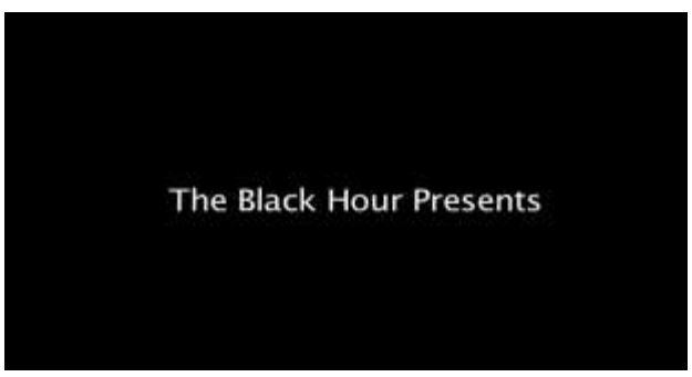
Shades of Black - Colorism, Skin Color Discrimination | The Black Hour