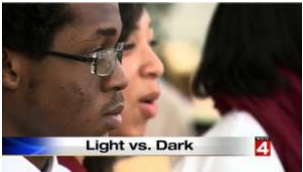
Colorism in the Black Community | Click On Detroit