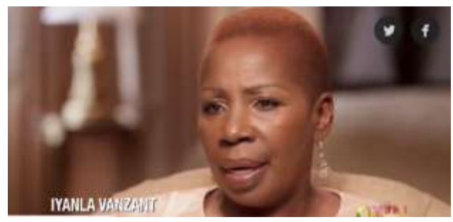
Light Girls | Huffington Post